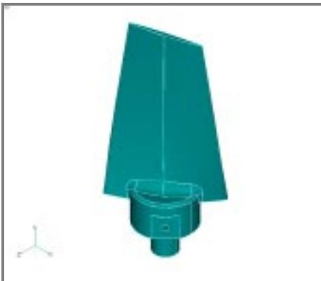
Figure 7b.2 - Solid Model of Blade